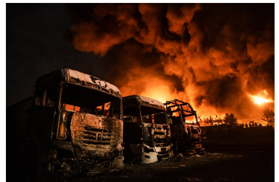
A fire breaks out at the Shahrani oil depot in Tehran.

- Archbishop Paul S. Coakley, President of the U.S. Conference of Catholic Bishops