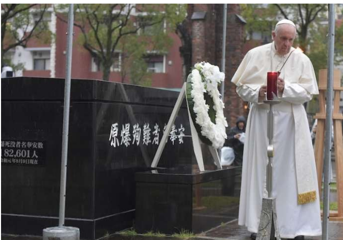
Pope Francis prays at the Nagasaki ground zero site, November 24, 2019.

“With deep conviction I wish once more to declare that the use of atomic energy for purposes of war is today, more than ever, a crime not only against the dignity of human beings but against any possible future for our common home . The use of atomic energy for purposes of war is immoral, just as the possessing of nuclear weapons is immoral ... We will be judged on this. Future generations will rise to condemn our failure if we spoke of peace but did not act to bring it about among the peoples on the earth. How can we speak of peace even as we build terrifying new weapons of war?