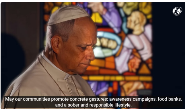
Pray with the Pope: That everyone might have food | May 2026

Ask Governor Hochul to support both bills by clicking here to sign the online petition. Please share the link with your fellow parishioners. After you sign, do one more step and call her office at (518)474-8390 with the same request.